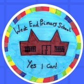
West End Primary 01670 822328